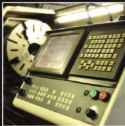
CNC Turning Lathe

WE HAVE 3000 SQ.FT. HIGH PRECIOUS MACHINE SHOP IN OUR FOUNDRY PREMISE.