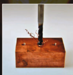
Hydraulic Tapping Machine